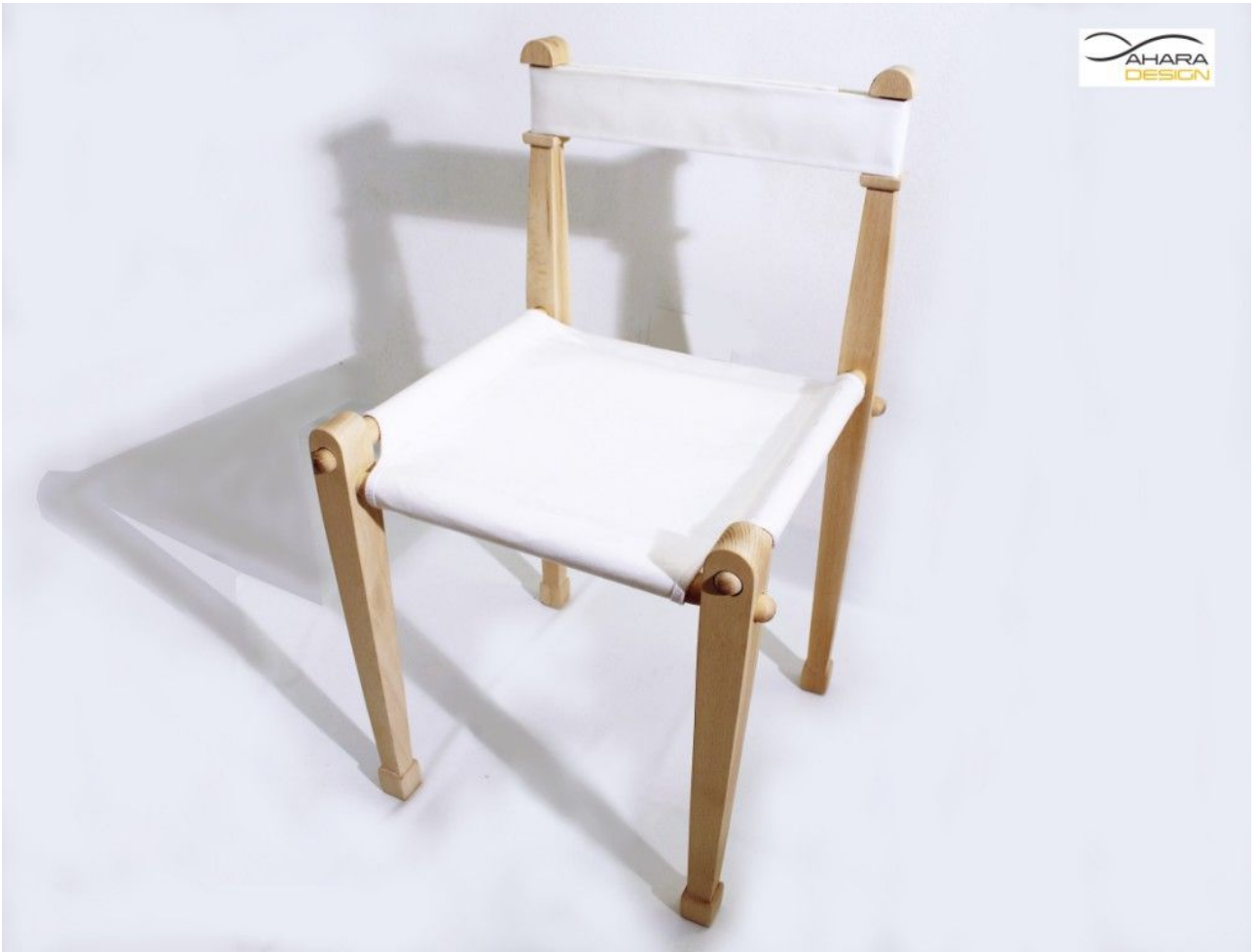
The chair is ready